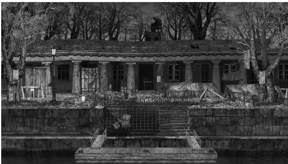
IC-98, A View From The Other Side (2011) HD animation; Courtesy of the artist and Frame Visual Art Finland. At ARCOMadrid with Galleria Heino.

For visitors to ARCOMadrid 2014, #FocusFinland will add up to being an exceptionally informative and wholly unique experience.